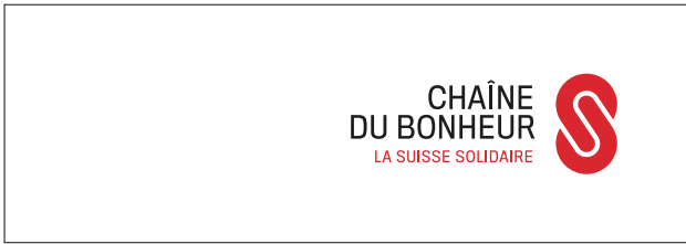
100% White background Color Logo