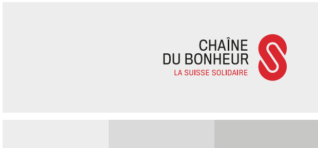
0% to 40% Black background Color Logo