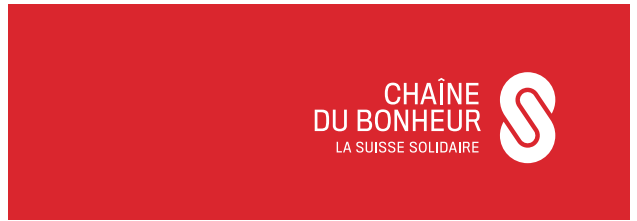
Red corporate background Negative Logo