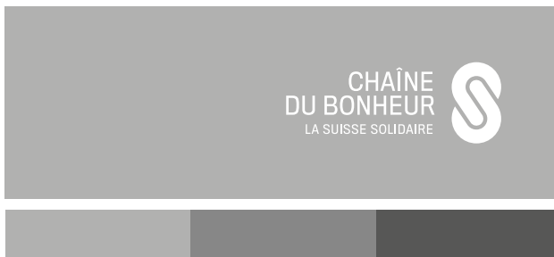
41% to 100% Black background Negative Logo