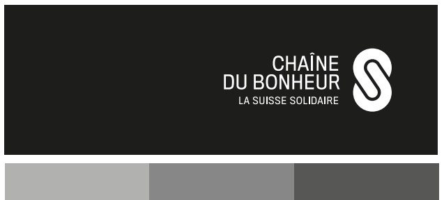
41% to 100% Black background Negative Logo