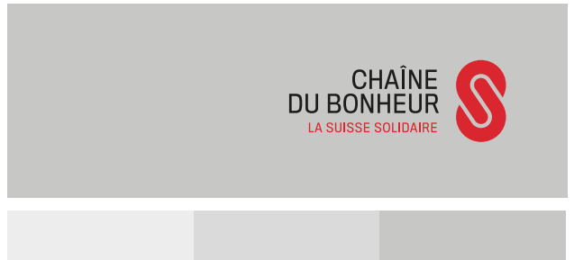
0% to 40% Black background Color Logo